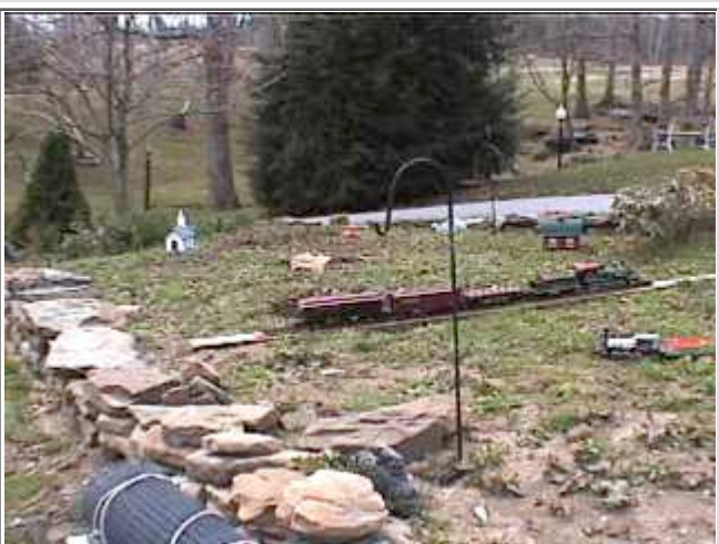
View S.W. (down hill) [Mar. 04]