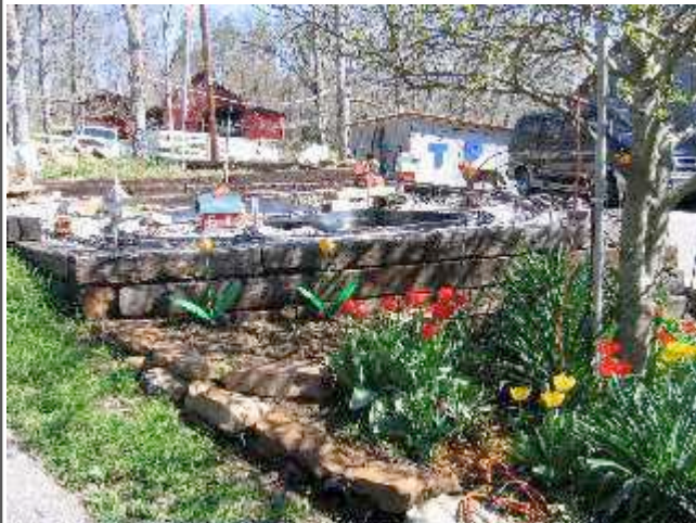
View North (up hill) [April 05]