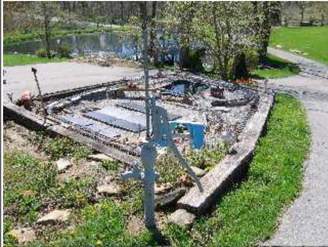
View S.E.(down hill) [April 05]