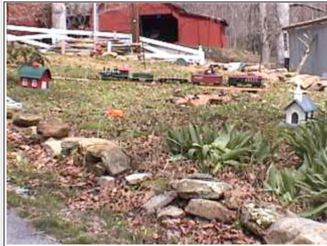
View North (up hill) [Mar. 04]