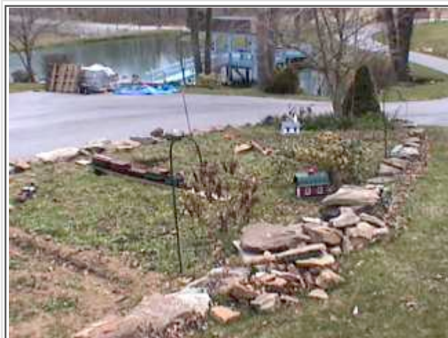
View S.E.(down hill) [Mar. 04]