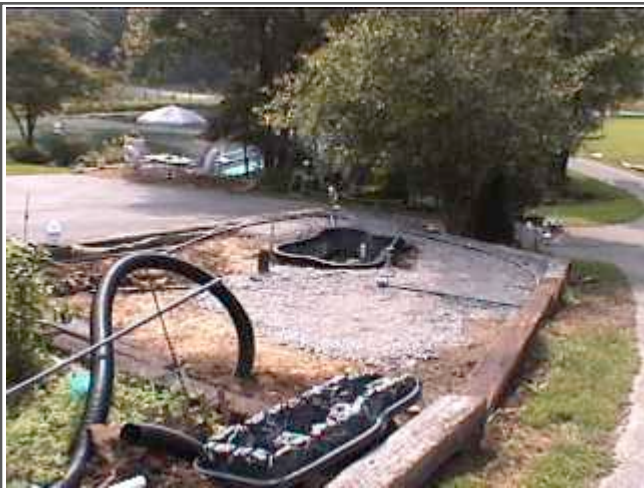
View S.E.(down hill) [Aug. 04]