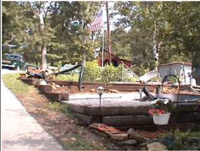
View North (up hill) [Aug. 04]