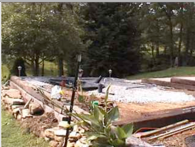
View S.W. (down hill) [Aug. 04]