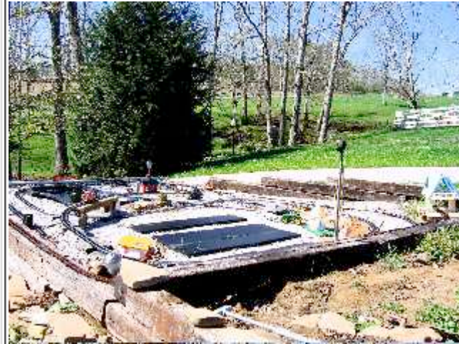
View S.W. (down hill) [April 05]